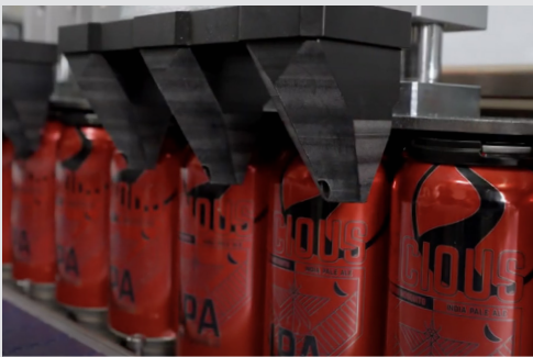
Magnetic Can Dividers Protect Cans and Machine From Damage