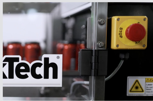
Category III Safety System