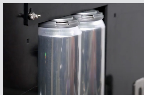
Simple Changeover for 12, 16, and 19.2 oz Cans