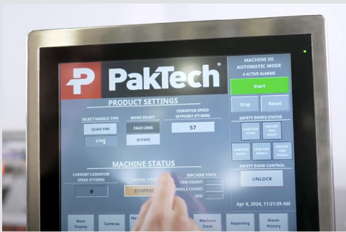
Tilt and Swivel Touchscreen HMI